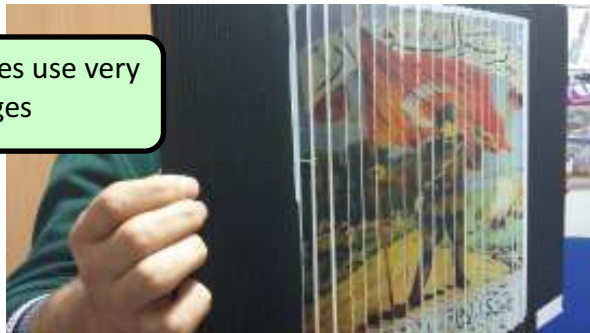
The two sides use very similar images

A group of history students training to be teachers at Adiyaman University, Turkey, worked on the idea of 'Different Perspectives', developing original and intriguing artwork which could be viewed from two angles. The students researched images related to Gallipoli and chose pictures which showed two different sides to a story. Here are some additional ideas.